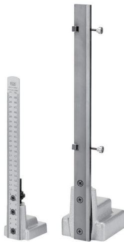
B - 1 B - 2