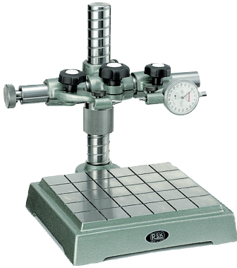
Cast iron type