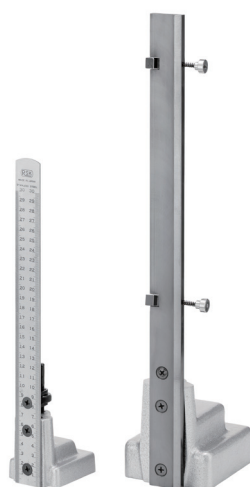
B - 1