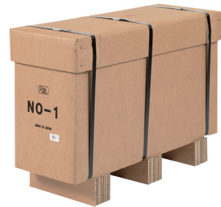
Packing type (NO-1)